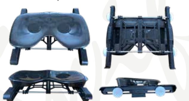
Double action type (add extra 220g per seat)