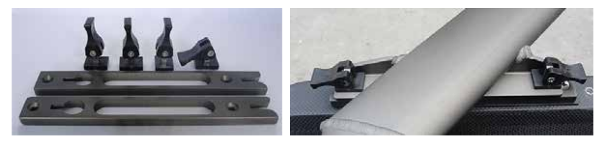
Quick Release (QR) parts are the same height as our standard 10mm spacer. Therefore when QR parts are used adjustability of work height is reduced by 10mm.

Our wing rigger quick release system is precision made, easy to use and reliable.