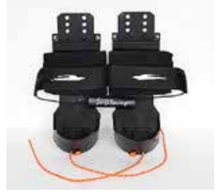
Heel restraints and solid heels for safety, rounded heels for a good fit. Approved by USRowing and British Rowing.