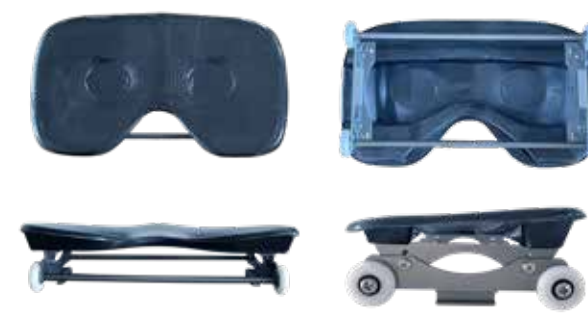
Single action type with bearings, height adjustable.

Elite carbon and Elite Plus boats are supplied with lightweight carbon seat tops.