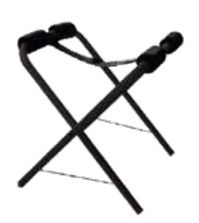
Steel trestles (simple for 1s & 2s)