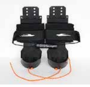
Heel restraints and solid heels for safety, rounded heels for a good fit. Approved by USRowing and British Rowing.