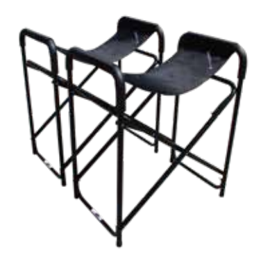
Steel trestles (small for 1s & 2s)