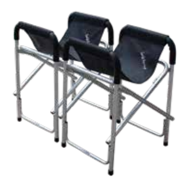
Aluminium trestles (small for 1s & 2s)