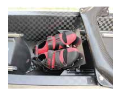
"Shark tooth" stretcher tracks system