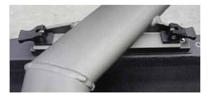
Quick Release (QR) parts are the same height as our standard 10mm spacer. Therefore when QR parts are used adjustability of work height is reduced by 10mm.