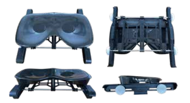
B. Double action type (add extra 220g per seat)