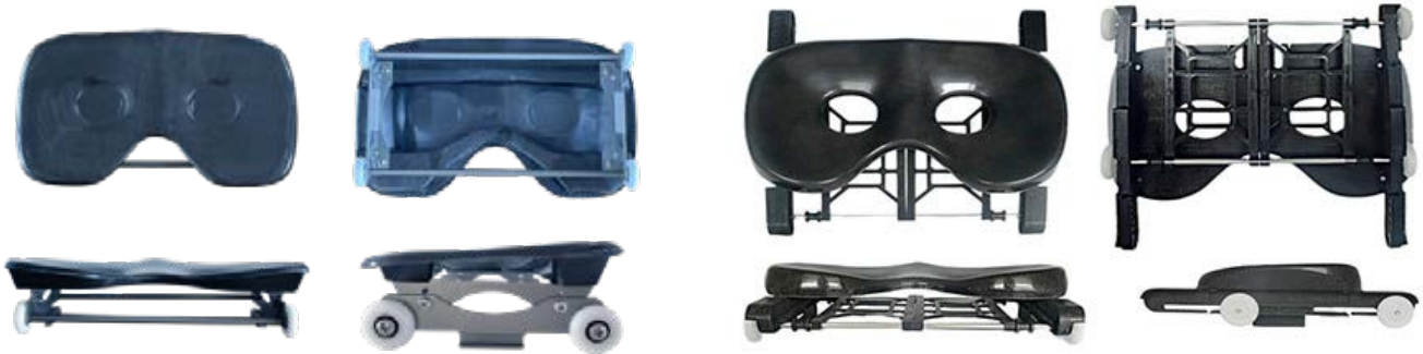
A. Single action type with bearings, height adjustable.

Elite and Club A boats are supplied with lightweight carbon seat tops.