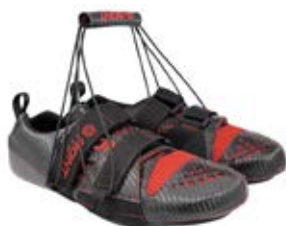
Bont Rowing shoes Sizes 36-53 available, but they are smaller than normal, so order 1 or 2 sizes larger.