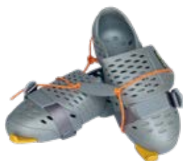
Active Tools adjustable shoes 2 sizes available: 40-45 and 43-48