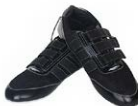
Swift Racing shoes Sizes 37-54 available