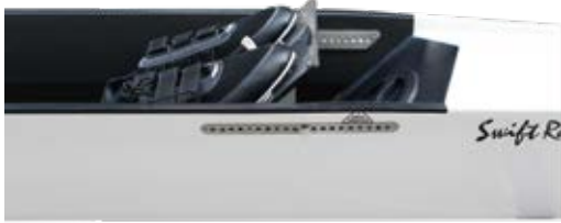
Sax mounted stretcher system (Only for CPro moulds 121-125)

Choice of stretcher attachment (new 1x moulds only).