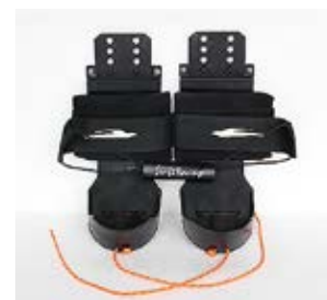
Heel restraints and solid heels for safety, rounded heels for a good fit. Approved by USRowing and British Rowing.