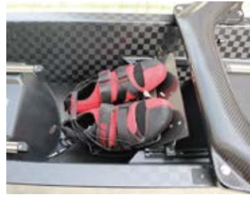
"Shark tooth" stretcher tracks system