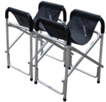
Aluminium trestles (small for 1s & 2s, large for 4s & 8s)