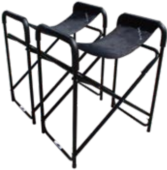
Steel trestles (small for 1s & 2s, large for 4s & 8s)