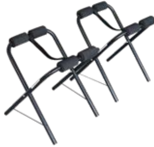
Steel trestles (simple for 1s & 2s)