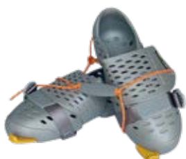
Active Tools adjustable shoes 2 sizes available: 40-45 and 43-48