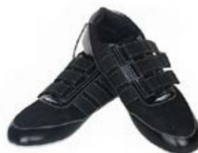
Swift Racing shoes Sizes 37-54 available