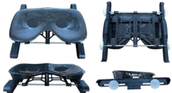
B. Double action type (add extra 220g per seat)