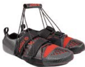
Bont Rowing shoes Sizes 36-53 available, but they are smaller than normal, so order 1 or 2 sizes larger.