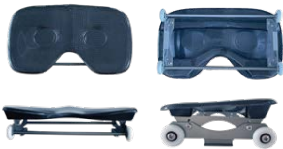
A. Single action type with bearings, height adjustable.

All boats are supplied with lightweight carbon seat tops.